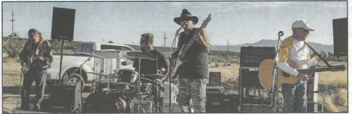
Right: The Barnyard Boys rockin' the fest. Below: Pie Eating Contest! Below right: Mutton Bustin'!